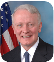
REPRESENTATIVE LEONARD LANCE New Jersey