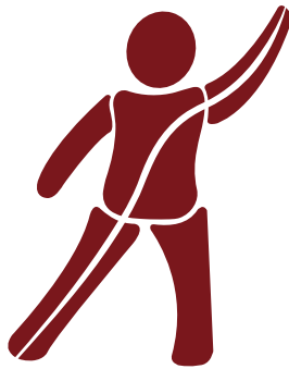
Healthcare-Associated VTE Prevention Challenge

If your hospital or healthcare facility has a successful strategy to prevent this growing public health problem, here's what to do: